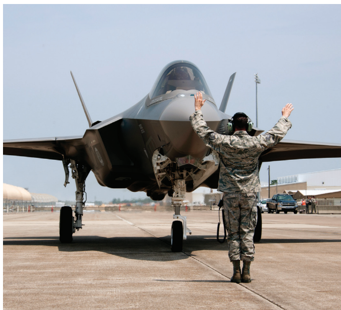
A 33rd Fighter Wing crew chief guides a production jet arriving at Eglin Air Force Base, Fla., to support pilot and maintenance training.

Joint Force Multiplier and Enabler: Embedded, network-enabled capability allows information gathered by F-35 sensors to be immediately shared with commanders at sea, in the air or on the ground for U.S. and coalition partners, providing an instantaneous, high-fidelity view of ongoing operations.