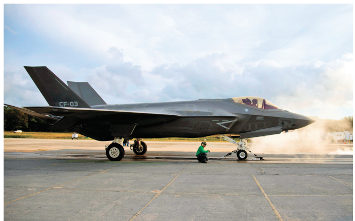
The F-35C completes its first steam catapult launch at Naval Air Systems Command, Lakehurst, N.J.