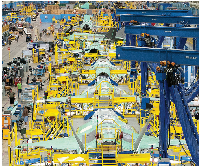
The state-of-the-art production facility in Fort Worth, Texas.

The F-35’s common manufacturing processes and parts, advanced digital design tools and assembly methods help achieve the program goals of affordability, quality and assembly speed. By incorporating lessons learned from development-aircraft production and using industry-standard engineering and manufacturing technologies to ensure precise and efficient assembly, the concurrent production of all three variants is steadily moving toward full-rate production.