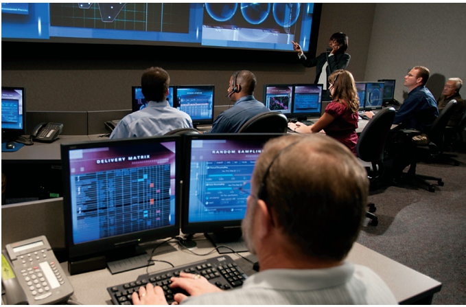
The Autonomic Logistics Global Sustainment (ALGS) Operations Center monitors and supports all aircraft in the fleet.